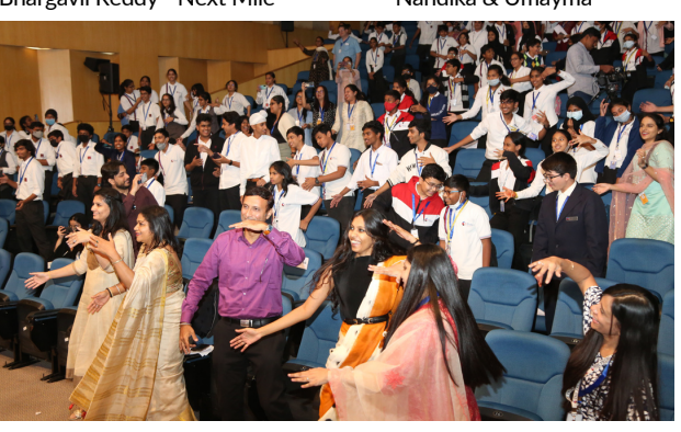
Unwind - Grooving to the Music