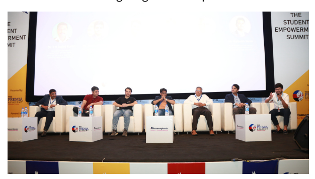
Future of S.T.E.A.M. Careers: Industry Experts