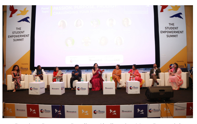
Passion, Purpose, Prodigy: Challenging Your Potential