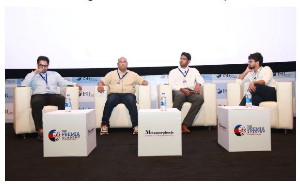
Future of Careers in Sports: Experts from the Sports Fraternity