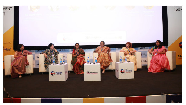
New Age Careers: Esteemed Principals