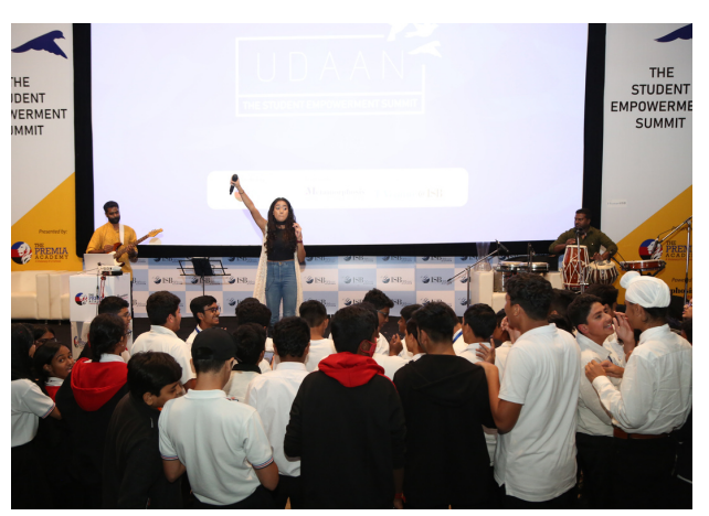
Electronic Fusion Set - K & K Duet