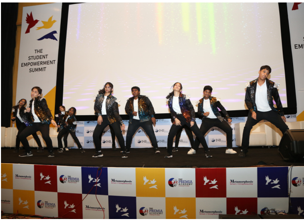
UDAAN Finale - Rise Up