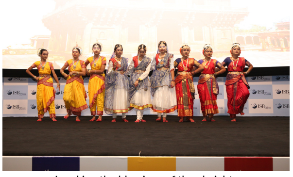
Invoking the blessings of the almighty